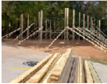
New Bus Barn