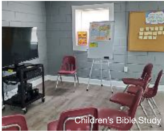
Children's Bible Study