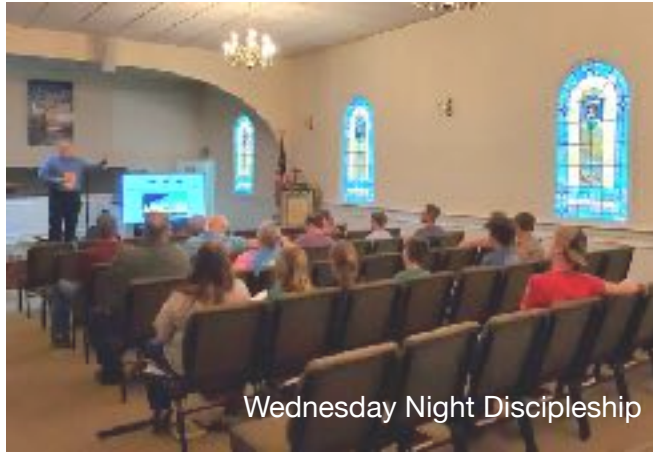
Wednesday Night Discipleship