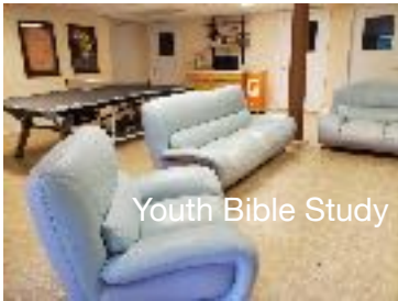
Youth Bible Study